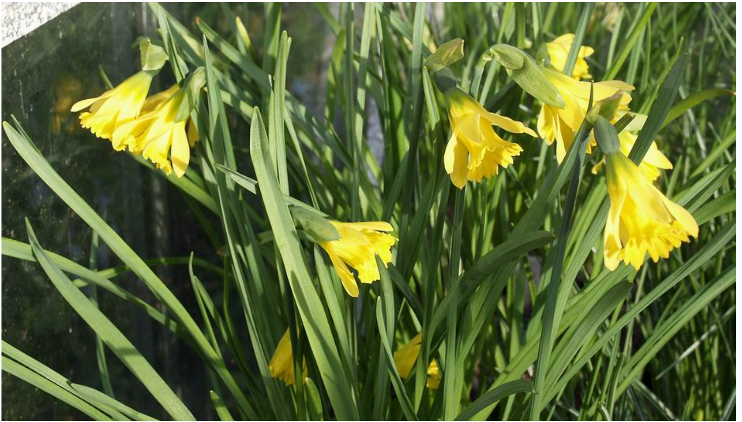
Narcissus 'Cedric Morris'

I always keep two pots of Narcissus 'Cedric Morris' in the bulb house both as an insurance policy and to better enjoy their flowers that can open as early as November although they were much later than that this year.