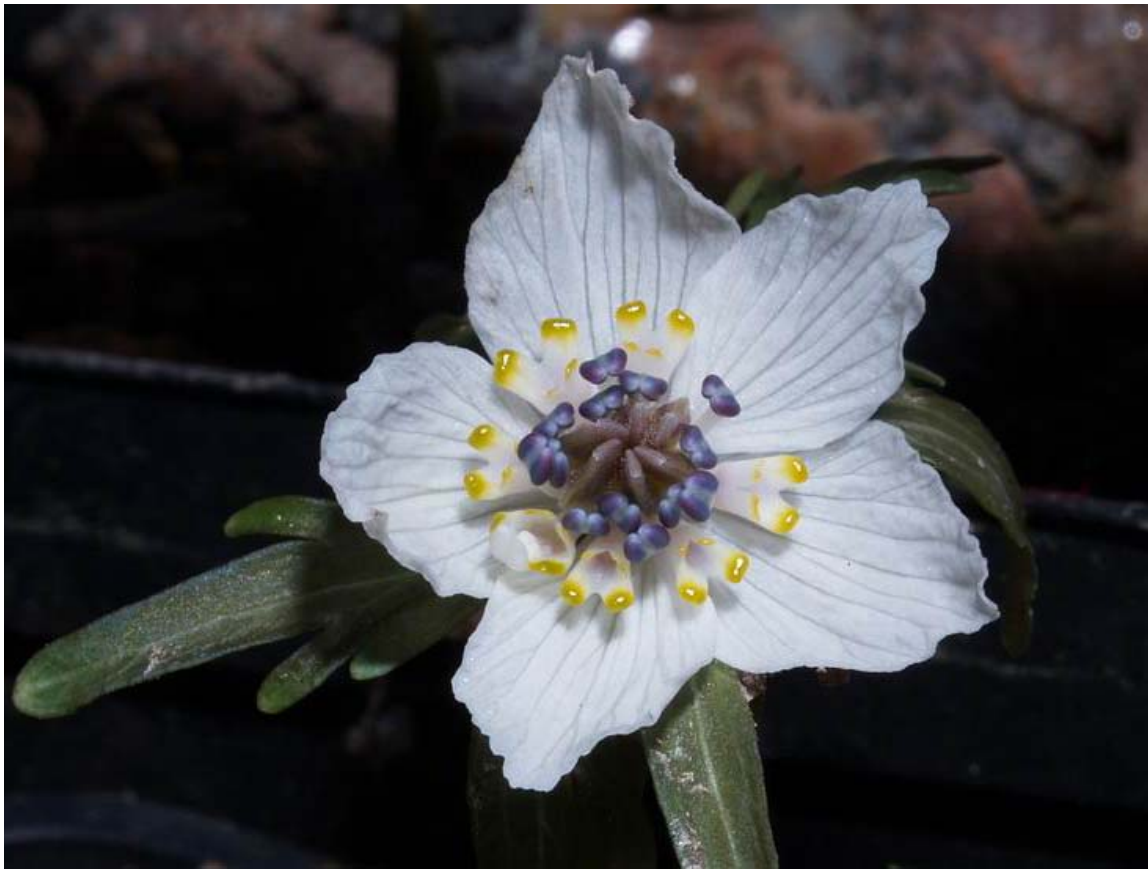
Eranthis pinnatifida flower

It is well on the way to being that beautiful flower now but it will expand a bit more yet.