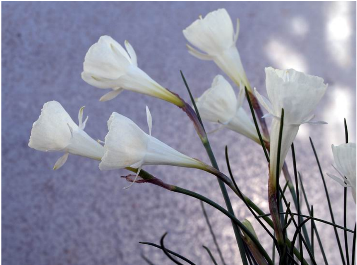
Narcissus cantabricus foliosus

I got a few bulbs of Narcissus 'Atlas Gold' from a friend two years ago and it has increased well and produces masses of its deep yellow flowers – it is a very good selection indeed. One of the many joys of raising bulbs (and all plants) is being able to share them with friends - giving them away when you have plenty and getting new forms or ones that you have suddenly lost back again - this is the way among most growers.