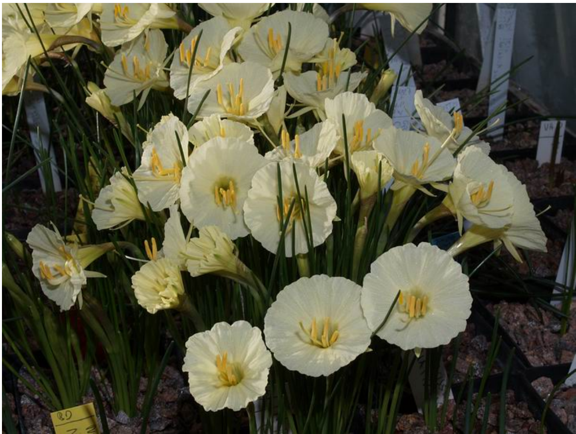
Narcissus romieuxii JCA805