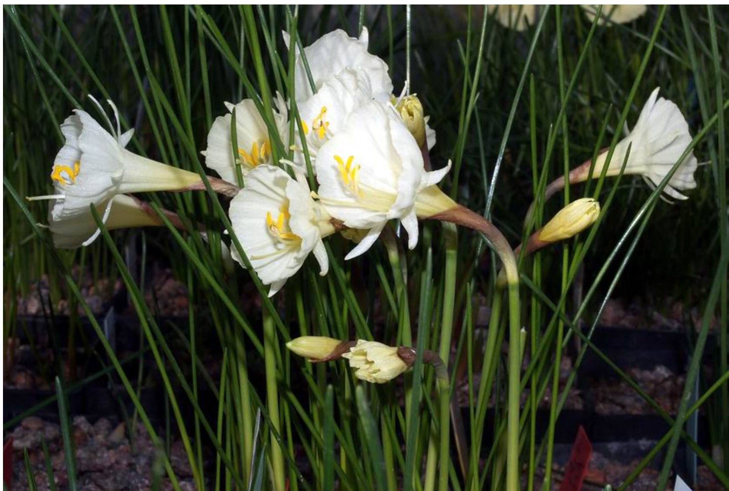
Narcissus seedling white

Moving into the Bulb house where one whole side is nearly taken up by variations of the hoop petticoat Narcissus - mainly forms or hybrids of N. romieuxii .