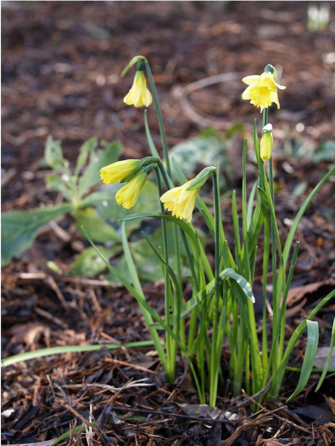
Narcissus 'Cedric Morris' in the garden

Back outside to end the week where I also have some clumps of Narcissus 'Cedric Morris' growing in the garden. One in a scree type bed and the one above in a woody type soil -it is the latter one that does best most years as it seems to prefer the moister conditions.