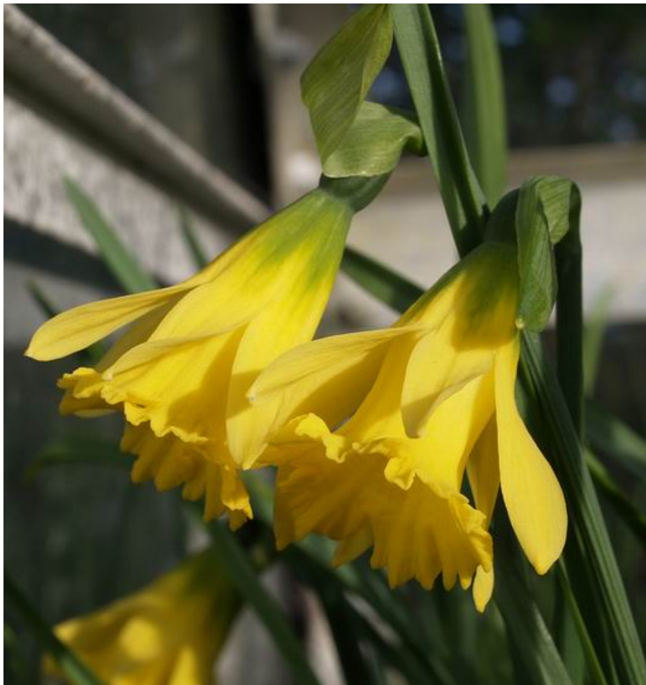
Narcissus 'Cedric Morris' flowers

I always keep two pots of Narcissus 'Cedric Morris' in the bulb house both as an insurance policy and to better enjoy their flowers that can open as early as November although they were much later than that this year.