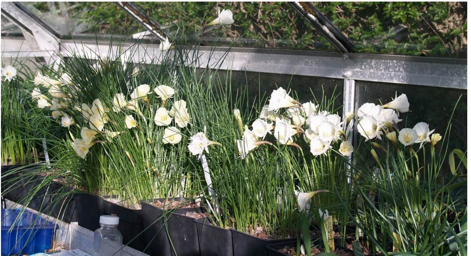
Narcissus in prop house

The most unusual and beautiful blue colour of Crocus baytopiorum is unique in the Crocus family. This is a new form that I just received from a friend last year my other potfull is only just pushing up now.