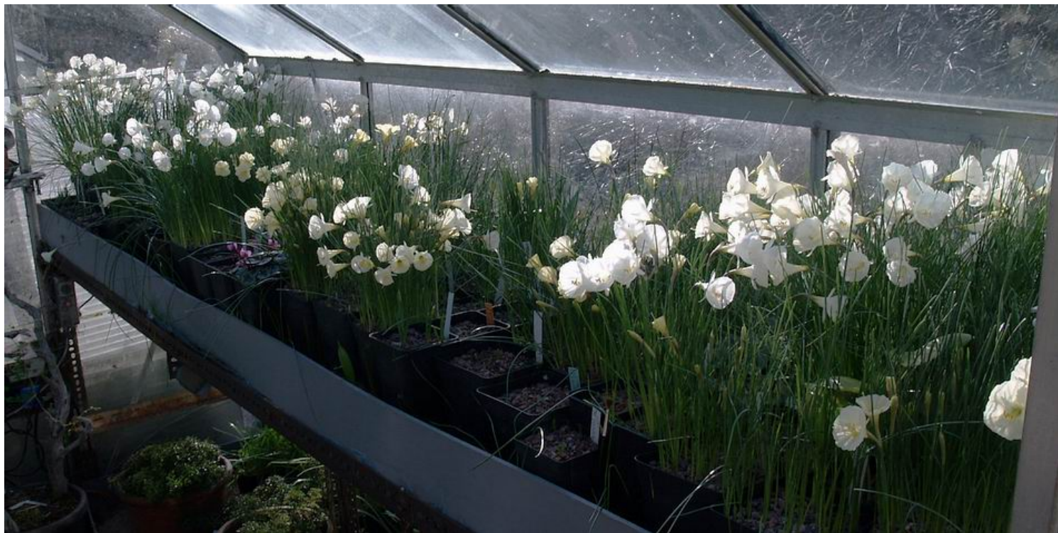
Narcissus in Bulbhouse

Moving into the Bulb house where one whole side is nearly taken up by variations of the hoop petticoat Narcissus - mainly forms or hybrids of N. romieuxii .