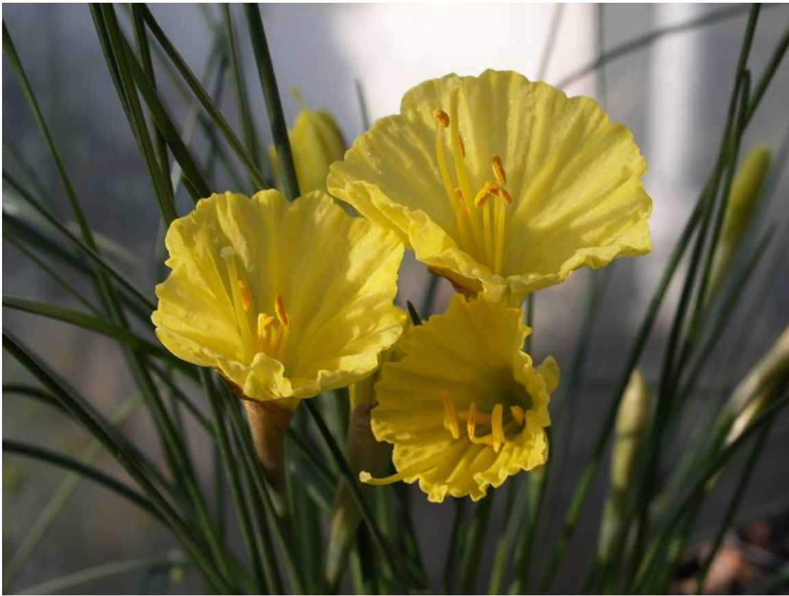
Narcissus 'Atlas Gold'

I got a few bulbs of Narcissus 'Atlas Gold' from a friend two years ago and it has increased well and produces masses of its deep yellow flowers – it is a very good selection indeed. One of the many joys of raising bulbs (and all plants) is being able to share them with friends - giving them away when you have plenty and getting new forms or ones that you have suddenly lost back again - this is the way among most growers.